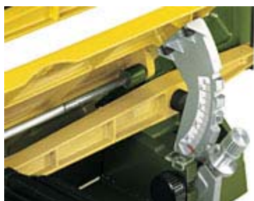
Table angle adjustment possible from 5° to 50°. With large dimensioned serrations at 0°, 10°, 20°, 30° and 45°. Additional fine adjustment for precise mitre and angle cuts.

Patented saw blade holders with high clamping force ensure true alignment of the saw blades. Recesses in the table surface serve as guide line in assembly to define position and distance of the saw blade holders.